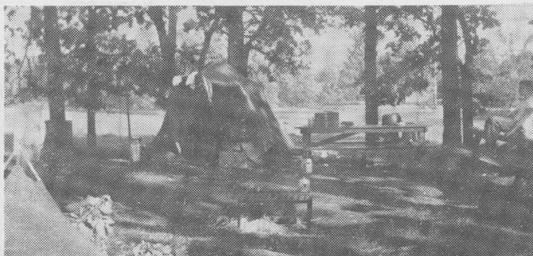
THE CAMP SITE AND THE SAFETY PATROL BOYS